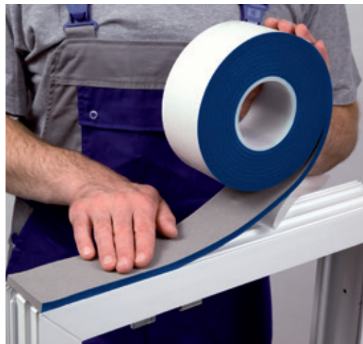
Installation example: ISO-BLOCO MULTI-FUNCTIONAL TAPE

* Movement of the components and temporary changes of length of the existing joints should be taken into account when determining the right strip size.