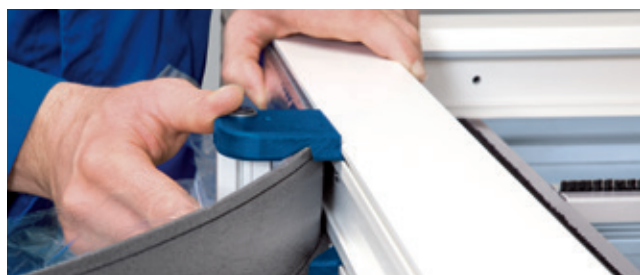
Installation example (CB): Fitting PVC windows

*** Available tape widths correspond to current price lists.