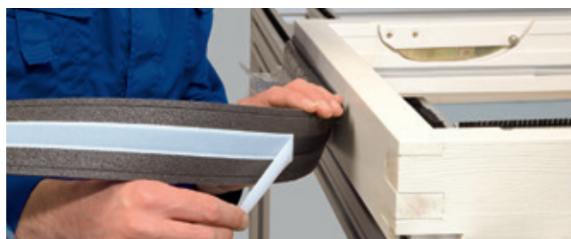
Installation example (1-BT): Fitting wooden windows