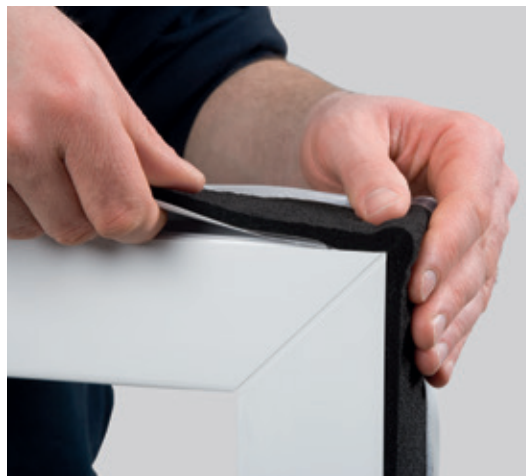
Installation example: ISO-BLOCO ONE

** Movement in structural elements and temporary longitude changes are to be taken into account by the max. joint width.