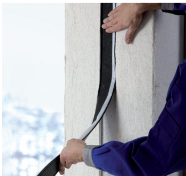
Installation example: ISO-BLOCO RENO

* Movement of the components and temporary changes of length of the existing joints should be taken into account when determining the right tape size. Installation depths of the U-recess beyond these areas of application can be reduced using suitable insulation materials.