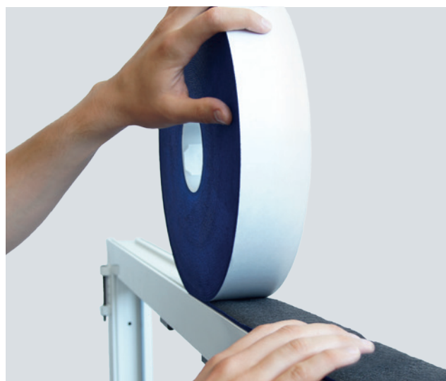
Installation example: ISO-BLOCO WIN2WALL

The details and information given in this literature are based on best current knowledge. They are intended to serve as general information only and it is advised that the user conducts their own tests for their specific set of conditions to determine the suitability of the product for its proposed use. No warranty or liability is given or implied regarding any part of these instructions or details, or the completeness of the information. We reserve the right to modify, or change, the specifications and information without advance notification. All goods are supplied subject to our standard conditions of sales, copies of which are available upon request.