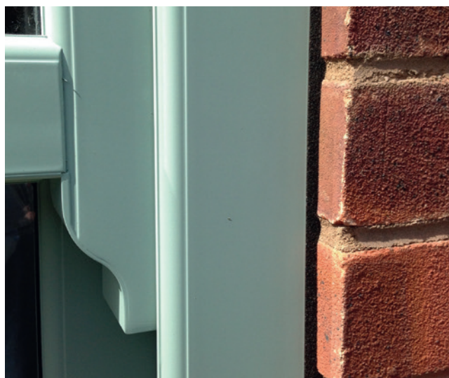
Installation example: ISO-BLOCO WIN2WALL

* Movement of the components and temporary changes of length of the existing joints should be taken into account when determining the right strip size.